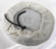
Rope String Tight-Up Type Pad Attachment