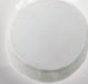
Velcro Type Pad Attachment