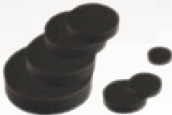
Black Flat Polisher Foams are available in various sizes from 1.5" - 7"