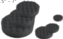
Black Wavy Polisher Foams are available in various sizes from 2" - 7"