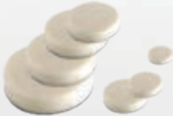
White Flat Polisher Foams are available in various sizes from 1.5" - 7"