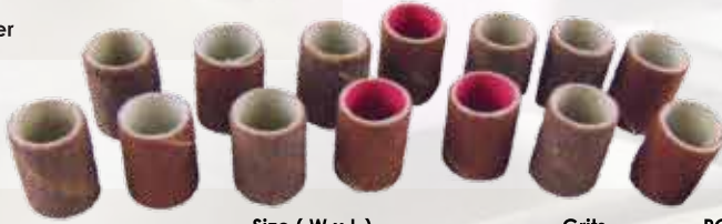
Sanding Drum Paper