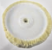
Nut Hole Type Pad Attachment