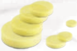
Yellow Flat Polisher Foams are available in various sizes from 1.5" - 7"