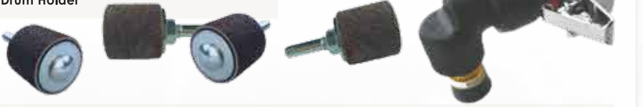
Sanding Drum Holder