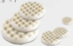
White Wavy Polisher Foams are available in various sizes from 2" - 7"