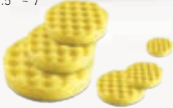
Yellow Wavy Polisher Foams are available in various sizes from 2" - 7"